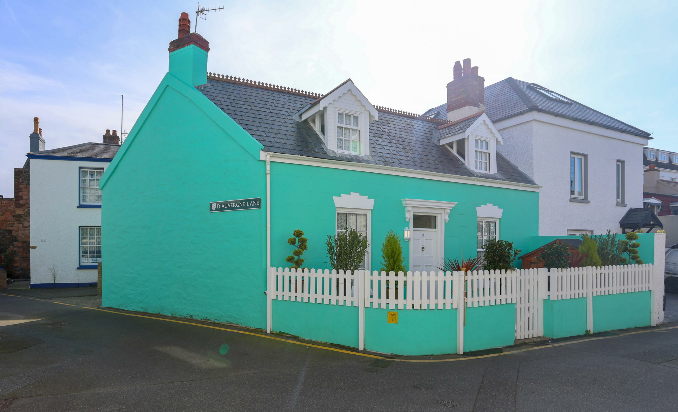
14 Marett Road, Havre des Pas, St. Helier, Jersey, JE2 4PQ £520,000